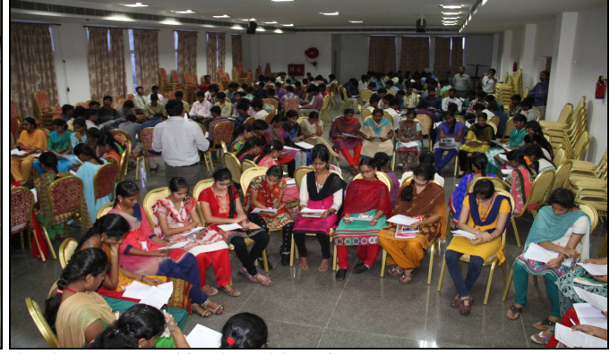
Students engaged in shared learning