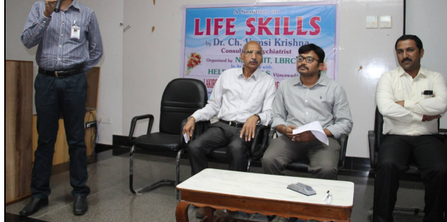
The NSS Programe Officer speaking about the program