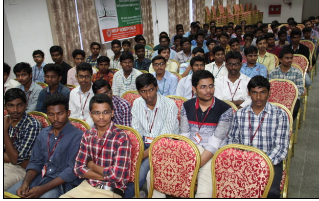
Young attendees of the program