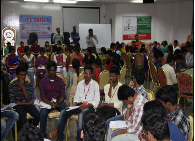
Students solving puzzles during the lecture